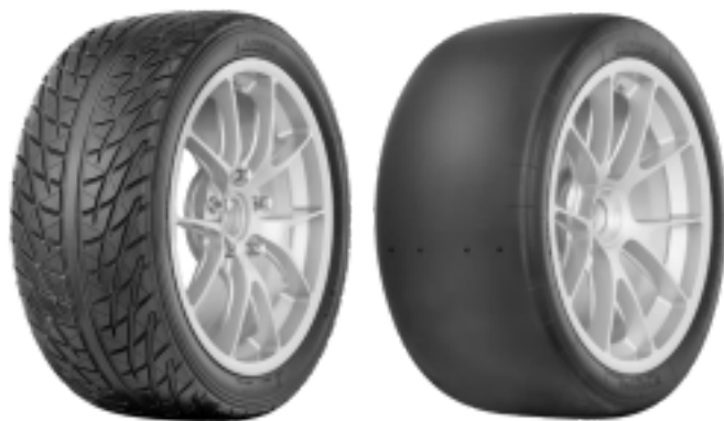
ADVAN A005 ADVAN A006

The technical specs for the ADVAN A005 dry tire and A006 wet tire to be used in the inaugural round of Porsche Sprint Challenge USA West at Apex Motor Club are listed below. A revised pricing bulletin and a new technical bulletin, including a comparison of the old and new dry tires, will be issued following the first PSCUW event. While the dry tire part numbers will change for subsequent rounds, the wet tire will remain the same through the 2026 season and beyond.