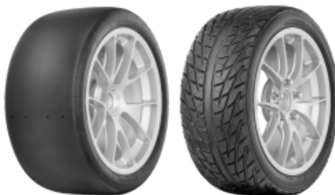
ADVAN A005 ADVAN A006

Starting with the second round, new dry tires will be introduced exclusively for the GT4 RS class. These tires feature an updated compound and construction and includes an RFID tag embedded in the sidewall. The new RFID tire will be available to PCA members beginning April 15th, 2026. A revised pricing bulletin and a new technical bulletin, including a comparison of the old and new tires, will be issued following the first event.